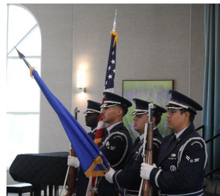
Luke AFB Color Guard at our May Dinner